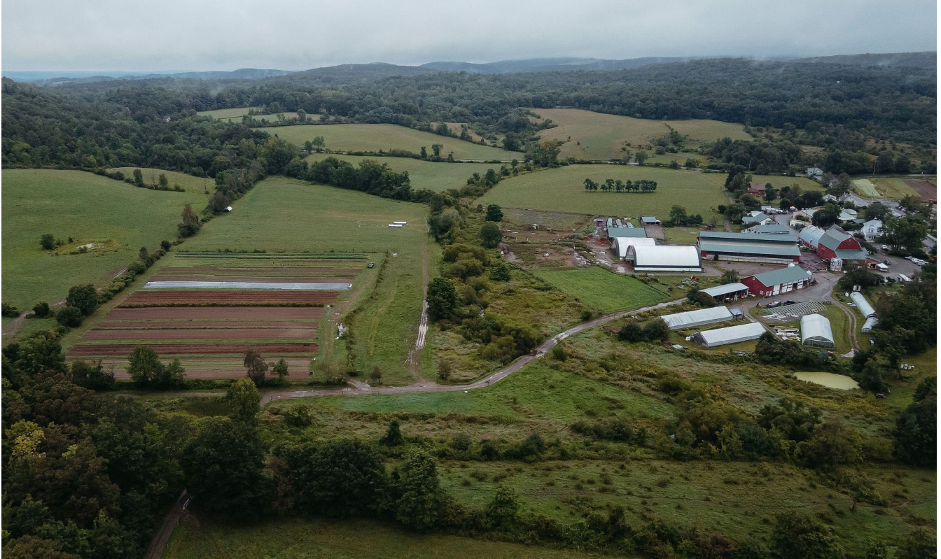
Hawthorne Valley Farm • Ghent, New York