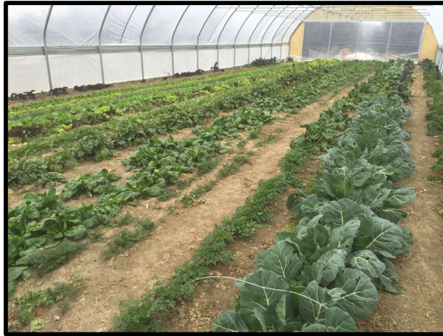
Common Good Farm • Raymond, NE