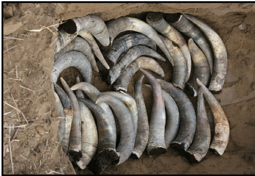
Cowhorn Vineyard & Garden • Applegate Valley, OR