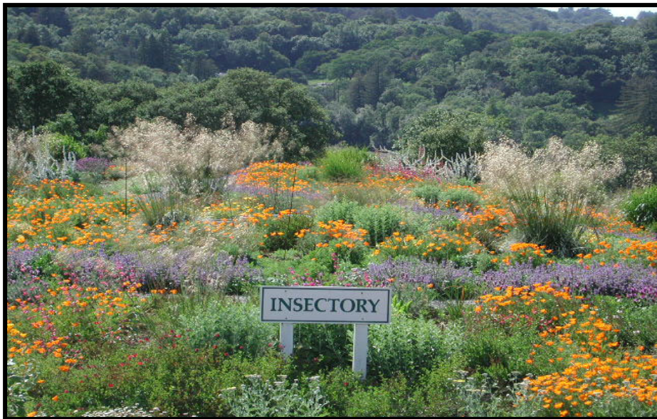
Benziger Family Winery • Sonoma, CA