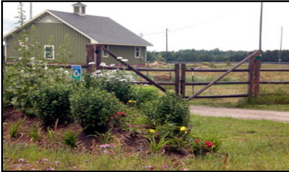
Light of Day Farm • Traverse City, MI