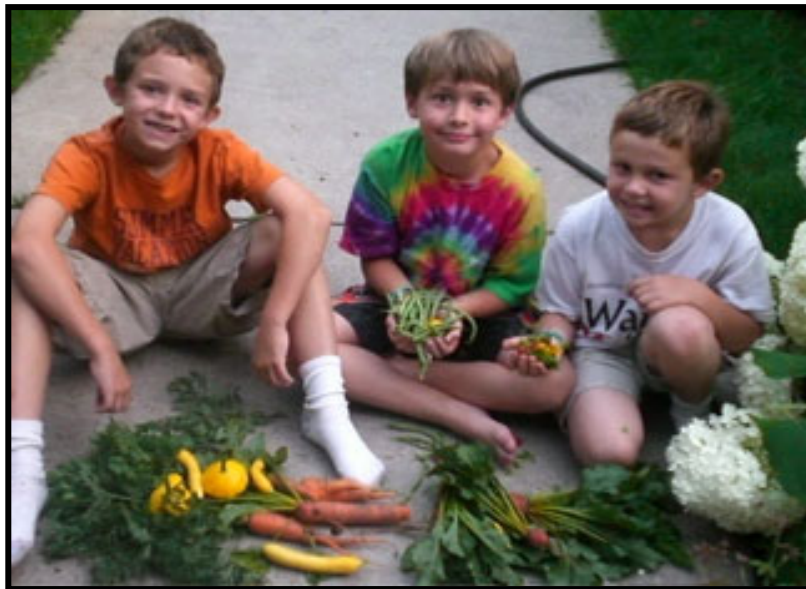
Light of Day Farm • Traverse City, MI