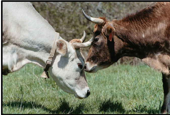
Hawthorne Valley Farm • Ghent, NY