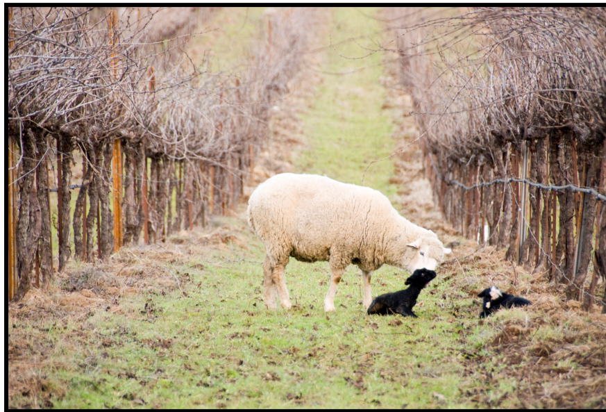
Frey Vineyards • Mendocino, CA