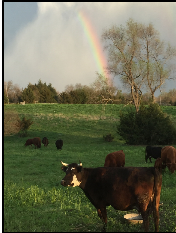
Common Good Farm • Raymond, NE