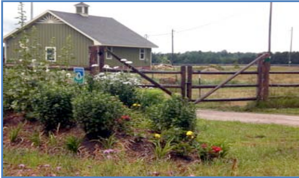
Light of Day Farm • Traverse City, MI