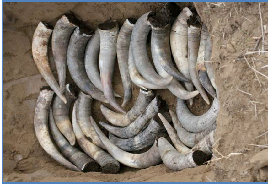
Cowhorn Vineyard & Garden • Applegate Valley, OR