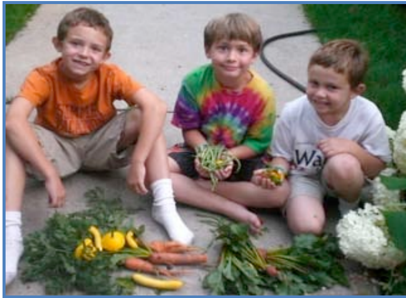
Light of Day Farm • Traverse City, MI