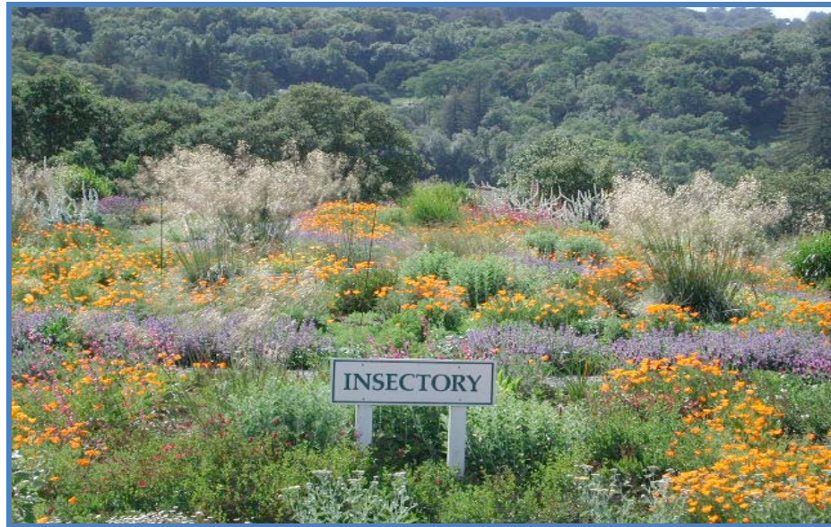
Benziger Family Winery • Sonoma, CA