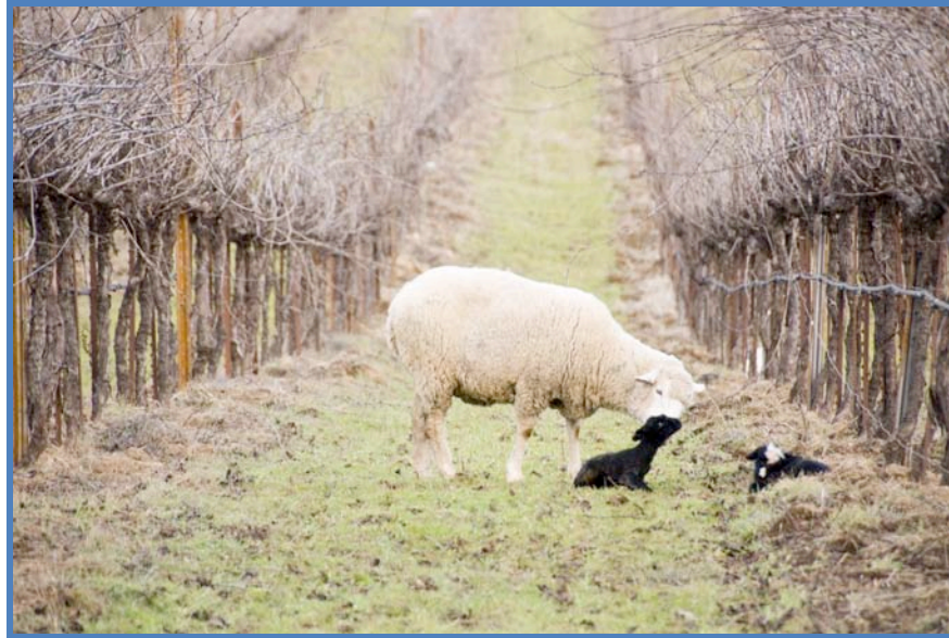
Frey Vineyards • Mendocino, CA