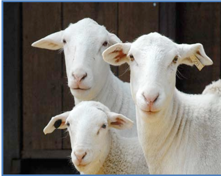
Dark Horse Ranch • Mendocino