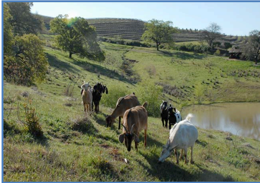
Dark Horse Ranch • Mendocino, CA