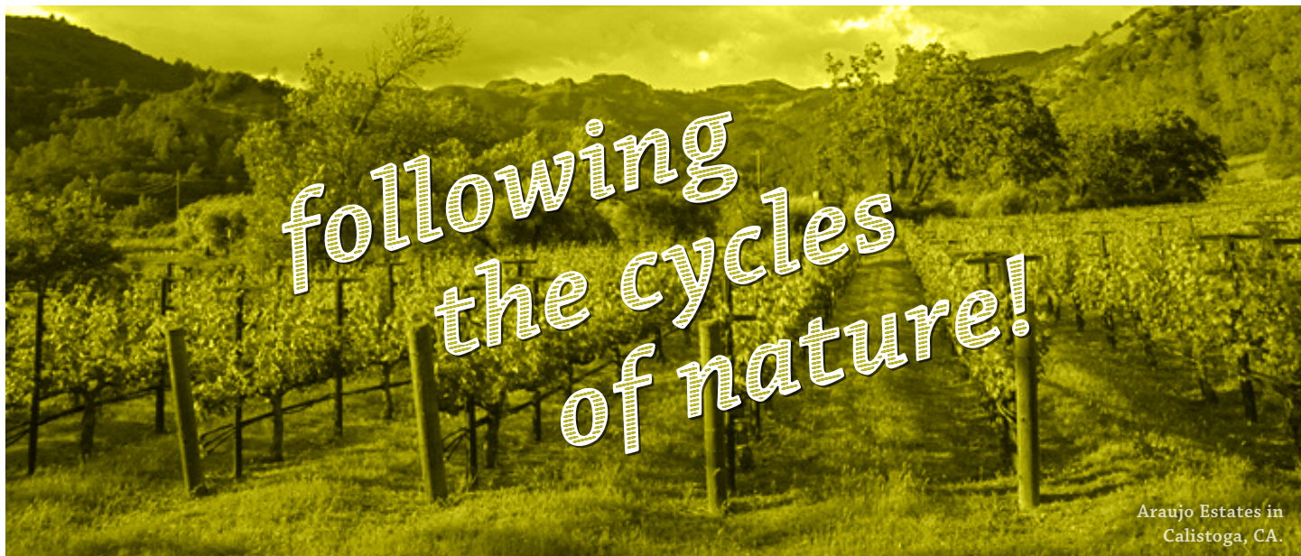
Araujo Estates in Calistoga, CA.