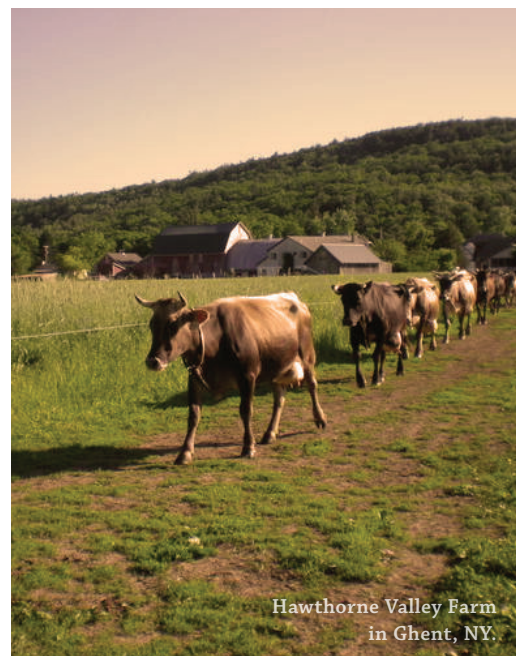
Hawthorne Valley Farm in Ghent, NY.

www.almanac.com | bit.ly/MariaThunAmazon | www.stellanatura.com