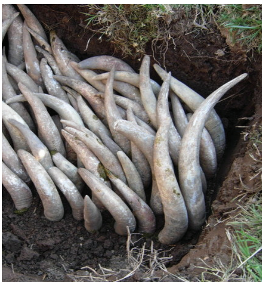
An example of cow horns used in Preparation 500 from Beaver Creek Vineyards in Middletown, CA. The resulting soil has many farming benefits.

! Demeter requests that Bio-Collective members allow Demeter the opportunity to proof press releases and any other communications that reference Biodynamic farming and products.