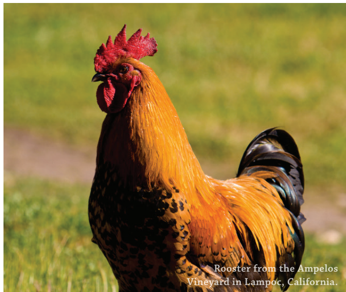
Rooster from the Ampelos Vineyard in Lampoc, California.

Demeter is regularly posting news and information on our website, social media sites, and via periodic e-newsletters. Be sure to sign up, and stay in touch!