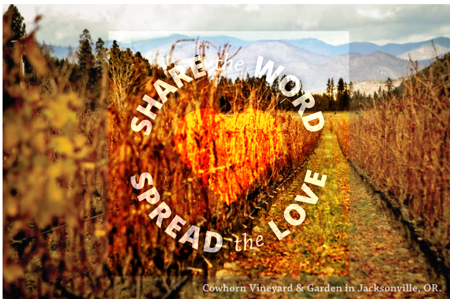
Cowhorn Vineyard & Garden in Jacksonville, OR.

Congratulations! You have the products; now shout it from the rooftops! Here are some simple steps you can take right now to get the word out about your Biodynamic products.