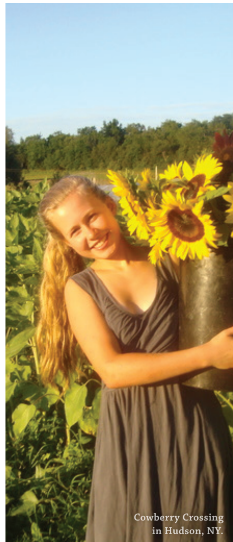
Cowberry Crossing in Hudson, NY.